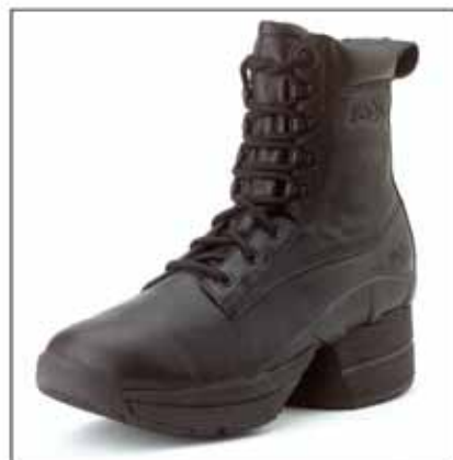
Z-Duty Work Boot

Because the Z-Coil Footwear company's goal is to achieve the greatest pain-relief benefits possible with its footwear, Z-Coil Pain Relief Footwear is sold only through authorized distributors who are specially trained to custom-fit the shoes. In fact, Z-Coil counts podiatrists, certified pedorthists, chiropractors, and physical therapists among its distributors. There are currently over 140 authorized Z-Coil stores in the U.S. across 40 states, as well as Canada and Puerto Rico.