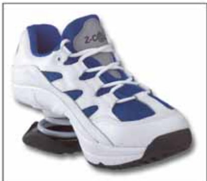
Z-Coil® Freedom 2000