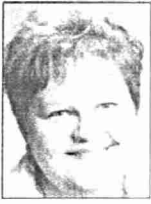
IN THE BAG A column by CINDY LARSON

WITHIN THE NEXT 30 days, a new pet store will open in the Village at Time Corners.